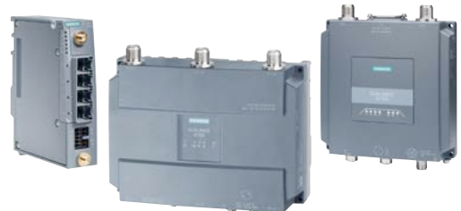
SCALANCE W770 and W730