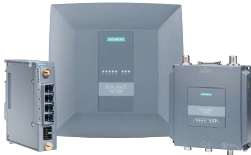
SCALANCE W1780 and W1740